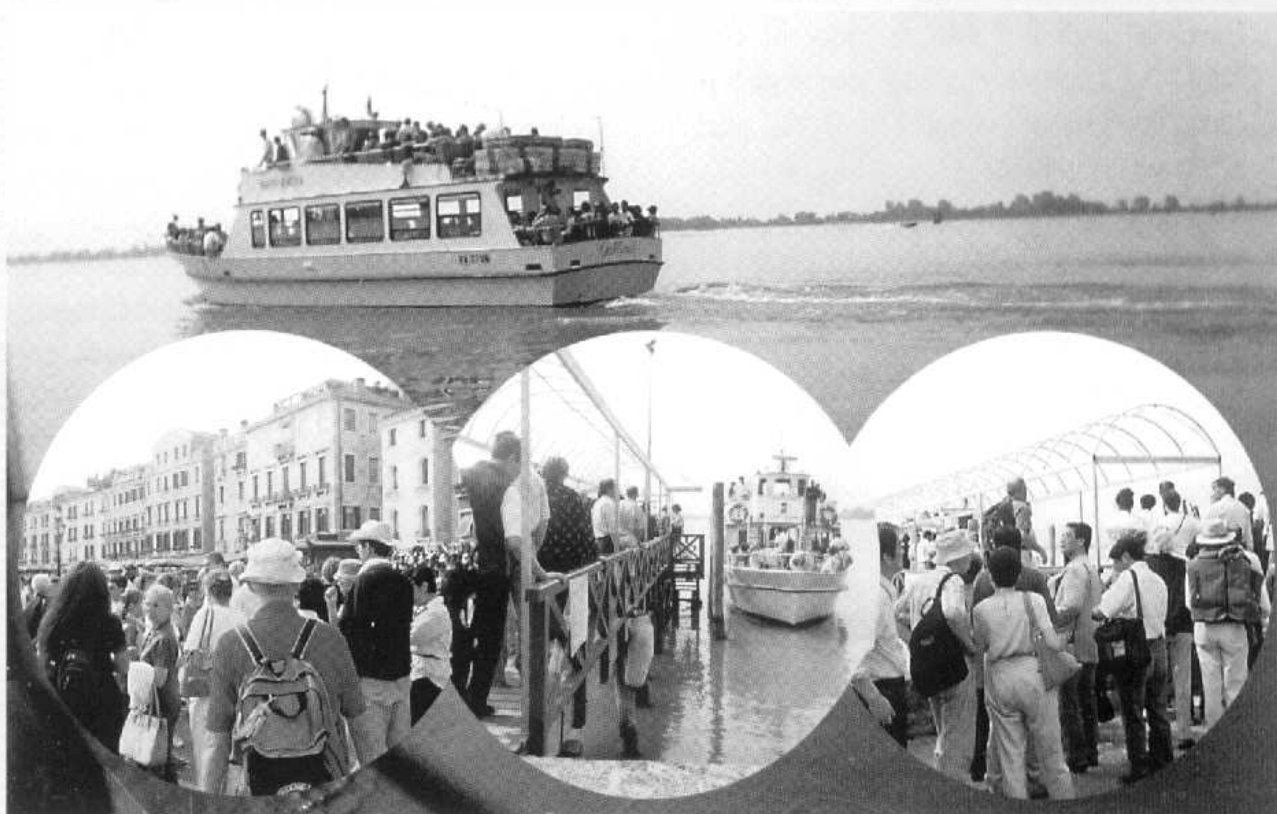
Group of participants to the excursions to Venice. The Social Programme of the Conference also included a get-together party and a fish-based Official Dinner served in a typical restaurant in Lido di Jesolo.

aimed at pinpointing the role of transport in engineered materials and devices for the operation of industrial processes of current or emerging interest and/or at assessing transport-related modification/degradation of materials and devices under working conditions have been the object of scientific presentations at Section C of the conference titled "Application of Transport Studies to Devices and Industrial Problems". A total of 26 oral contributions offered